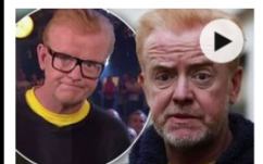
'F*** off and die!': Chris Evans reached breaking point over Top Gear abuse