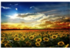
Low resolution image at 72 dpi which will look crisp on a monitor but look choppy when printed in a book.

but when creating digital graphics we need to think a lot more about the quality of an image. It's not just the resolution that matters, but also the file size. A large file size can slow down a website or a computer. The resolutions are 72dpi (low-res) and 300dpi (high-res) being either quite large or really small.